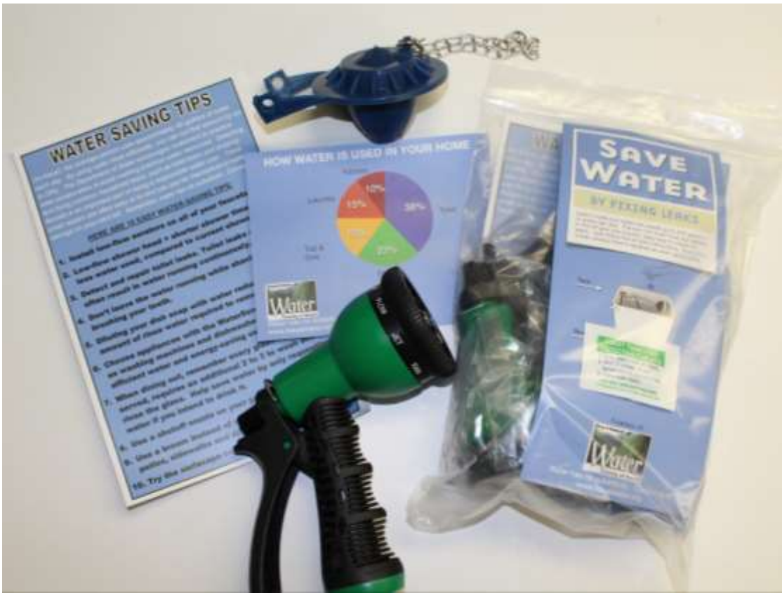
DOW's leak detection starter kits (shown above) will be offered free to the public in honor of EPA's Fix a Leak Week on Kaua'i.