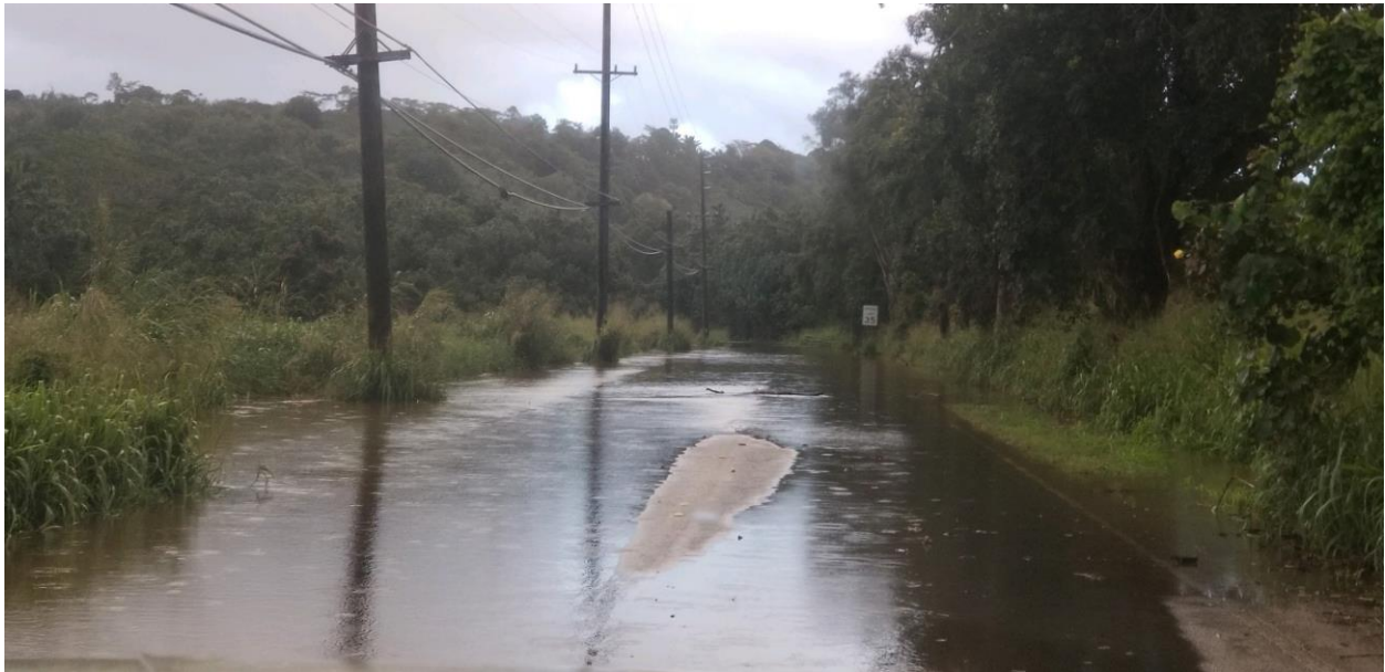
Kūhiō Highway in the vicinity of Hanalei Bridge remains closed due to flash flooding.