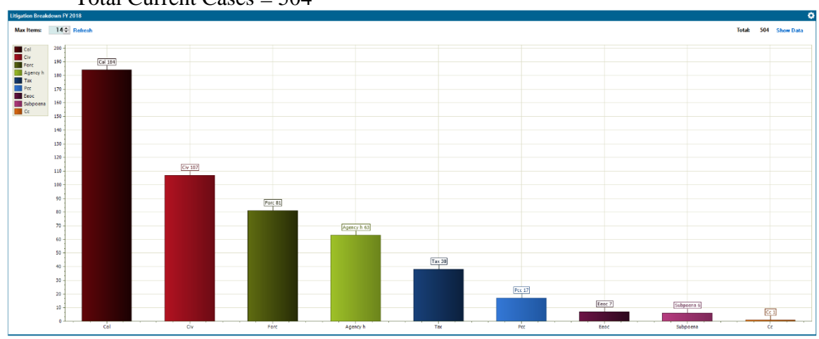
Chart: Litigation Division Current for FY 2018 Total Current Cases = 504