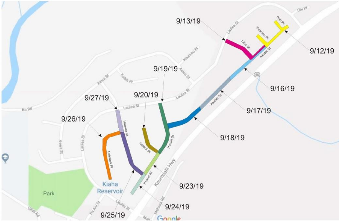
Photo caption: Seal coating work will affect portions of the 'Ele'ele Subdivision on Sept. 12 to 27, from 7:30 a.m. to 6 p.m.