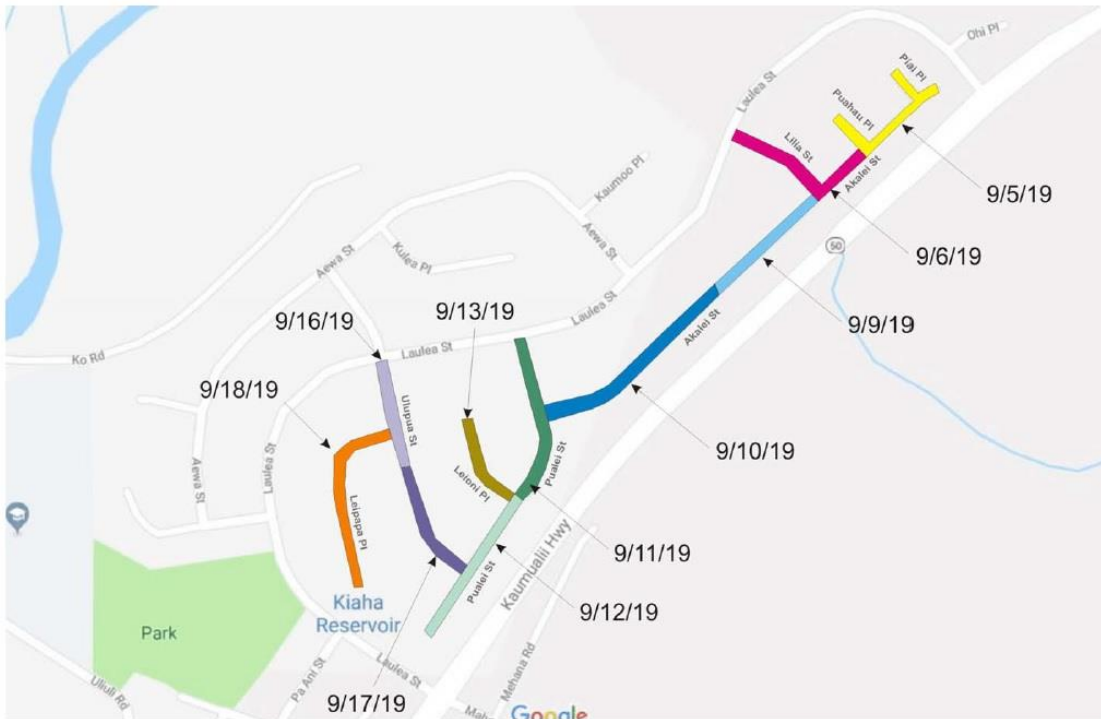
Photo caption: Grass cutting and weed control work will affect portions of 'Ele'ele Subdivision through Sept. 18, from 7:30 a.m. to 5 p.m.

P.O. Box 4319 Honolulu, Hawaii 96812 Phone: (808)682-6081 Fax: (808)833-9255