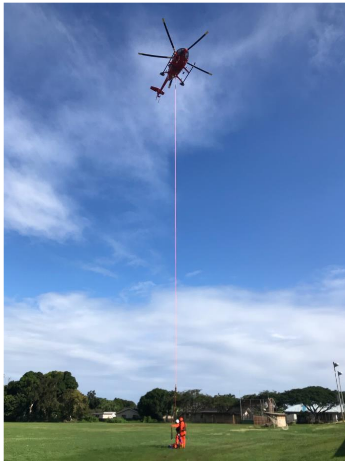
Photo: Air 1 and Rescue 3 personnel launch from the Wailua Houselots Park on Wednesday as they prepare to conduct a rescue along the Sleeping Giant trail.

A Flash Flood Warning was in effect for Kaua'i from approximately 4 a.m. to 1 p.m., Wednesday, closing major roads due to flooding conditions, along with fallen trees, utility lines, and debris. All roads have since been reopened.