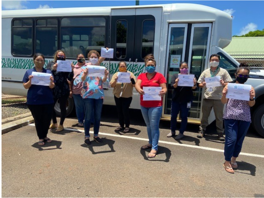
Kauai Bus Team Members sharing the certificates they received from attending the May 2020 Dementia Friends workshop.