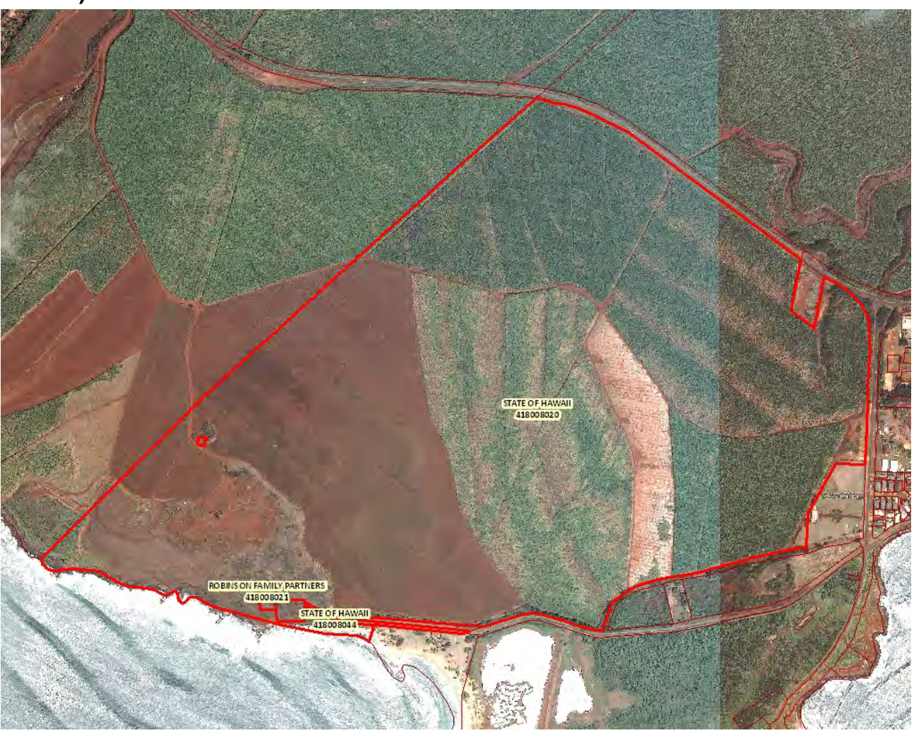
Salt Pond Beach Park Buffer Area for Protection of Hanapēpē Salt Pans (Waimea District)