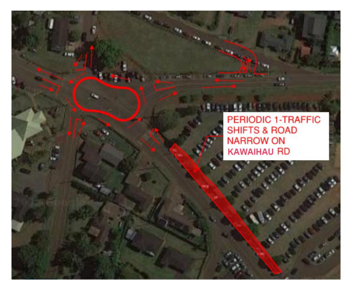
Figure 2: Traffic Control from Feb. 13 to Feb. 17