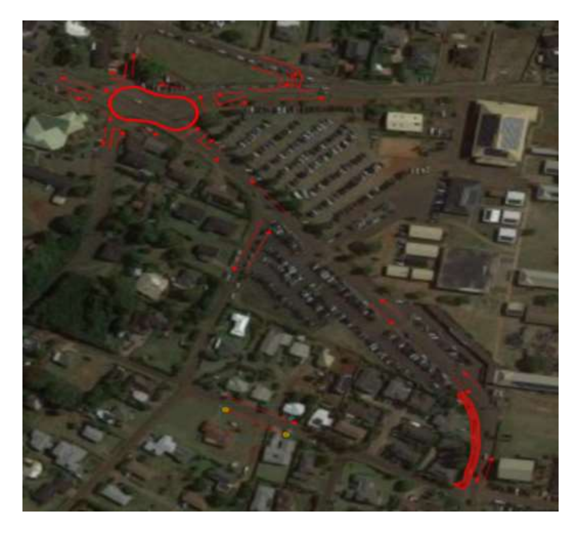
Figure 2: Traffic Control from Feb. 27 to Mar. 3