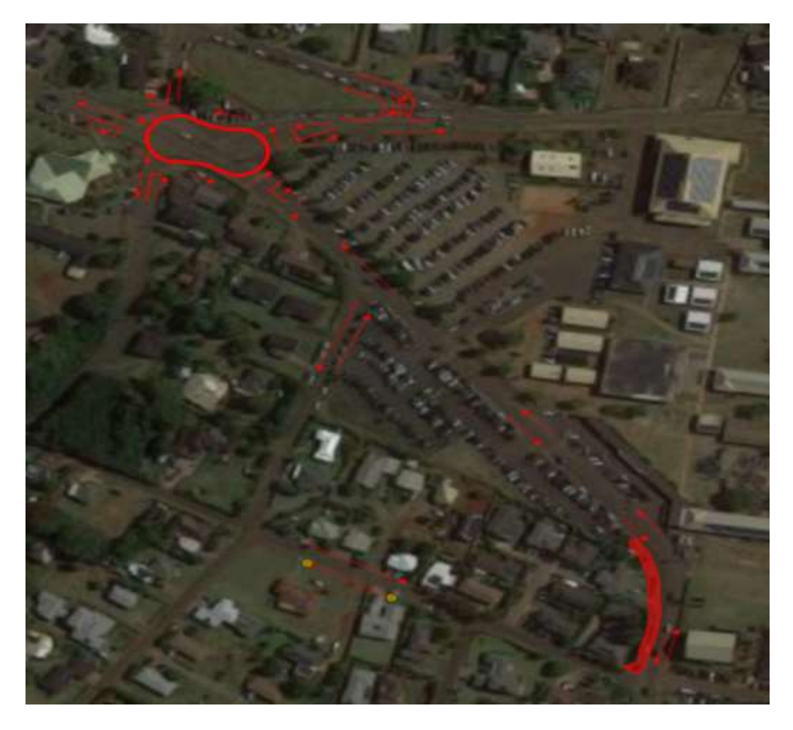
Figure 2: Traffic Control from March 6 to March 10