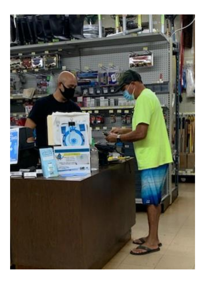
Photo 1: Toilet tablets displayed near the registers at Tanaka Hardware store in Līhu'e.

For more information about Fix a Leak Week, and other leak detection tips from the EPA WaterSense program, visit <a href="www.epa.gov/watersense">www.epa.gov/watersense</a>. The Department of Water, County of Kaua'i is an EPA WaterSense Partner and is a recent award winner of the EPA WaterSense 2021 Excellence Award for its outreach and education programs.