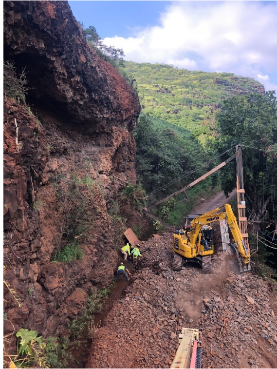
Below photos were taken on Saturday, Jan. 22: