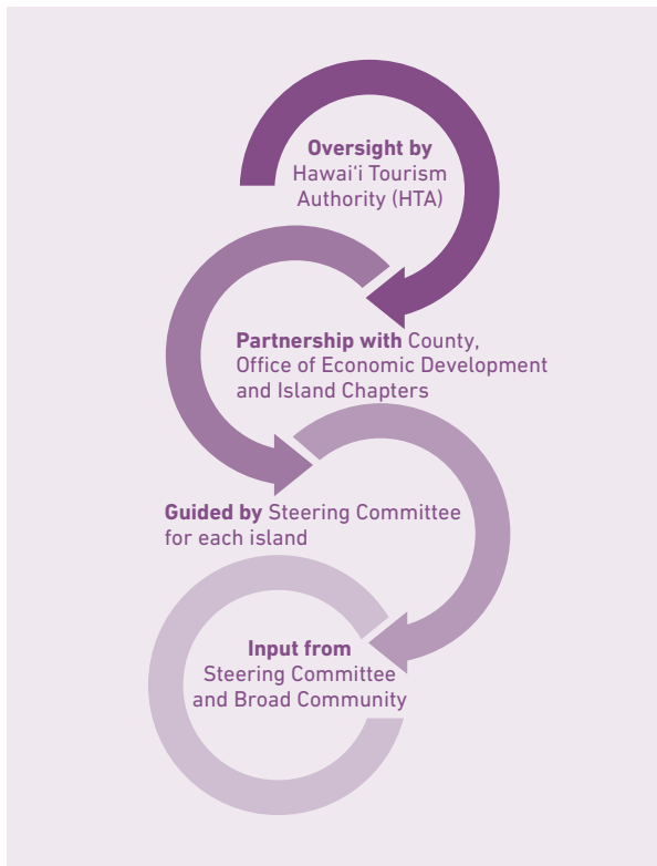
Figure 1 Collaborative Process

After reviewing the community feedback, the Steering Committee met virtually for a third time, and selected 10 anchor actions that the DMAP would focus on. Employees of HTA, the county, and KVB reviewed the proposed actions to verify they could be done under their respective purviews. In the end, nine final draft anchor and sub-actions were reviewed and approved by the Steering Committee at their last meeting. All of the actions were developed by the Steering Committee with input from the community.