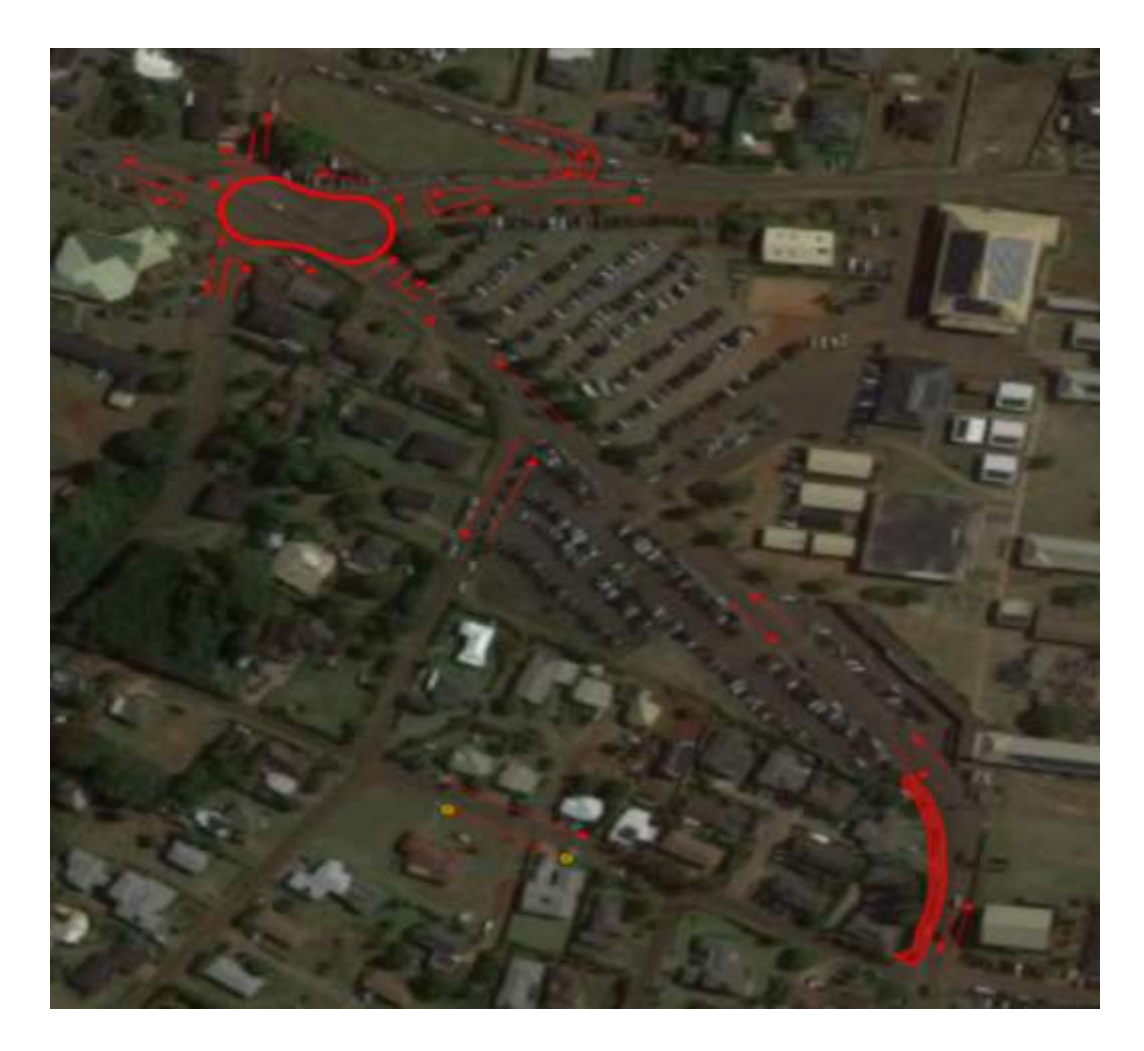
Figure 2: Traffic Control from March 13 to March 17