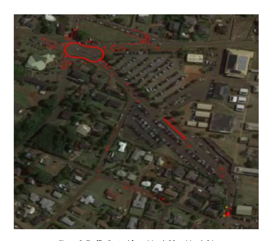
Figure 2: Traffic Control from March 20 to March 24