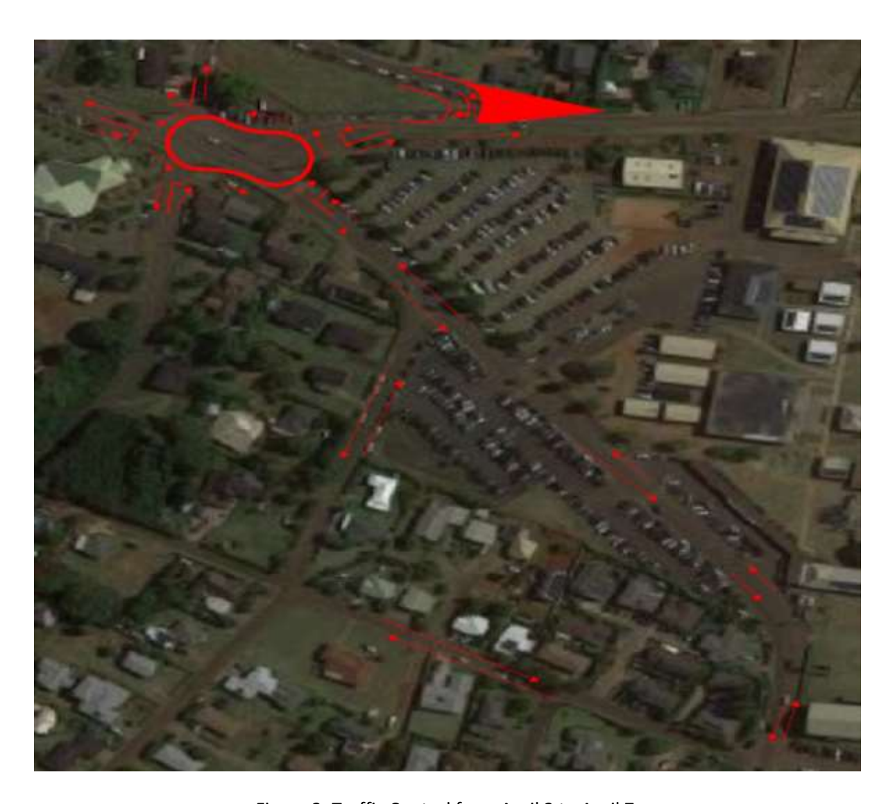
Figure 2: Traffic Control from April 3 to April 7.