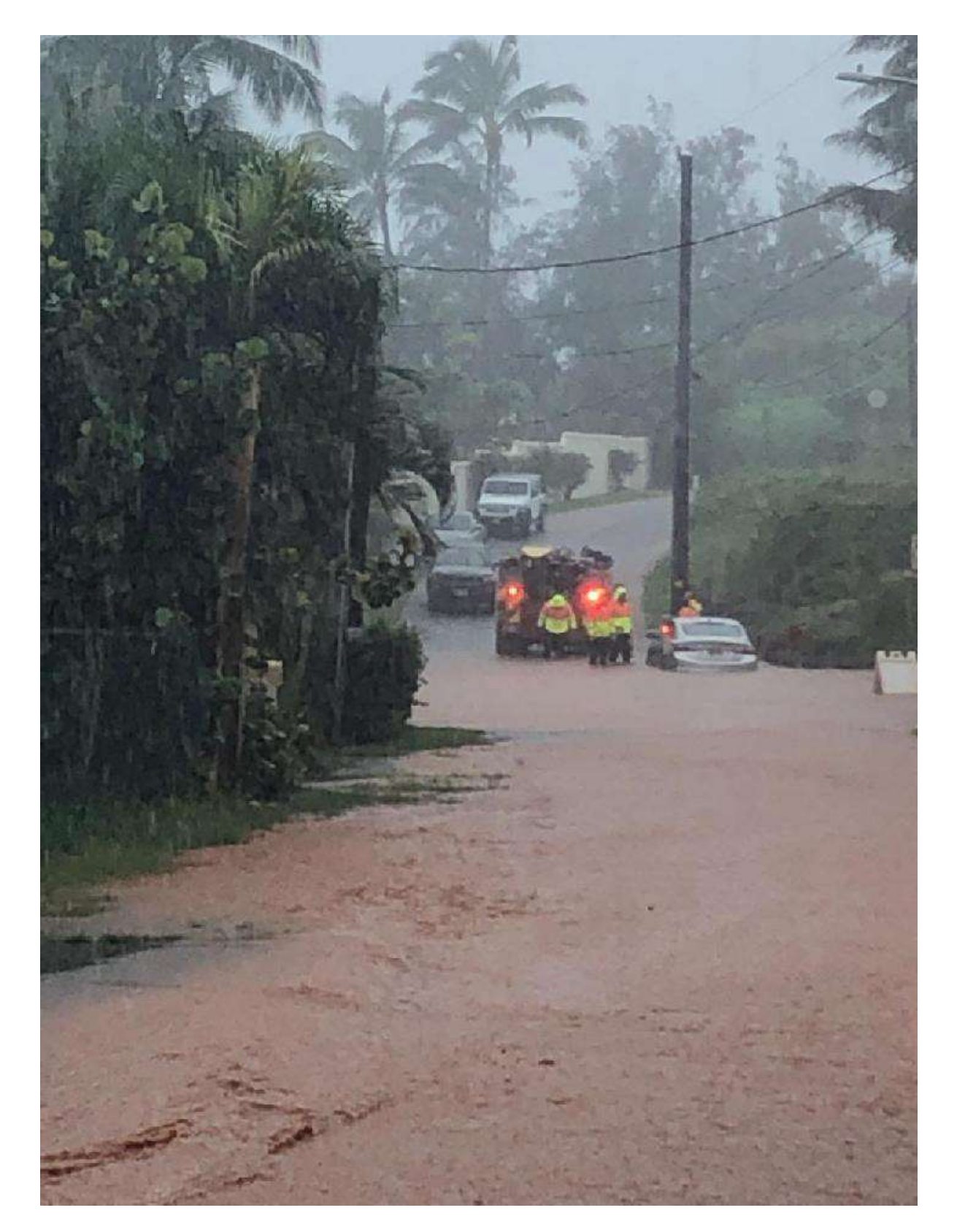
Photo caption: On Thursday, first responders rescue two individuals from a car on Lāwa'i Road near the National Tropical Botanical Gardens.