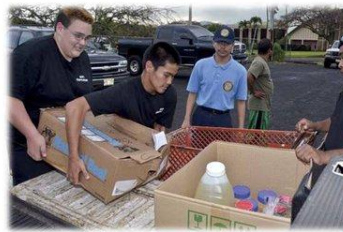
Kaua'i Police Explorer Scouts wrestle with a heavy box of beef for the Kokua Soup Kitchen while awaiting the start of dinner service, Tuesday at the Salvation Army, Lihu'e Corps.

As an Explorer, young adults have the opportunity to assist the Kaua'i Police Department by assisting officers with traffic control and security at community events, participating in law enforcement training sessions and community-relations activities. Through these activities, Explorers broaden their understanding and firsthand knowledge of the challenges and job skills that make up their community's police service. In addition to gaining a working knowledge of police work, the participants have the opportunity to give of themselves to their community. There were five Explorers in the program in 2010.