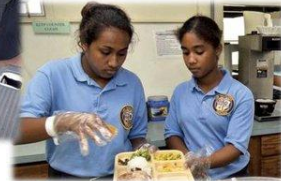
Kaua'i Police Explorer Scouts finish up a dinner plate, Tuesday at the Salvation Army Kokua Soup Kitchen at the Lihu'e Corps.