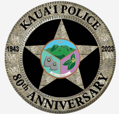
2023 KPD 80th Anniversary redesigned badge