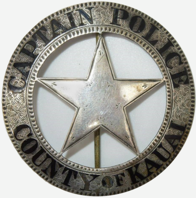
One of the original County of Kaua'i police badges